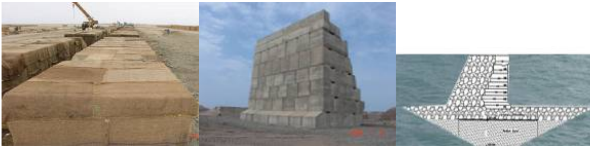
High Quality of Effective Cost