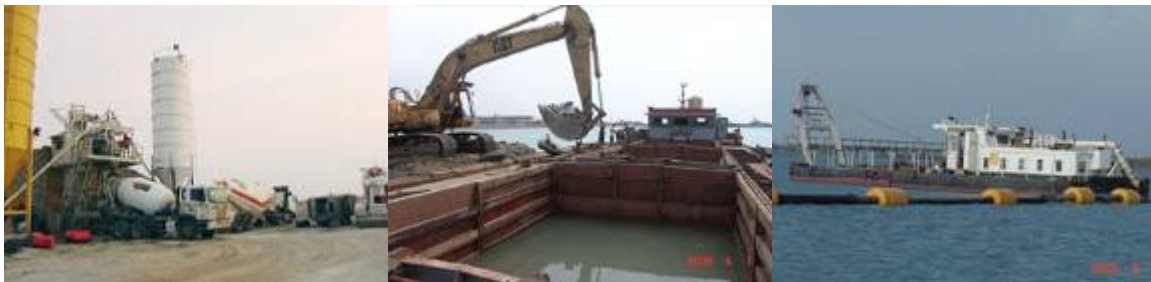
Sufficiency of Equipment