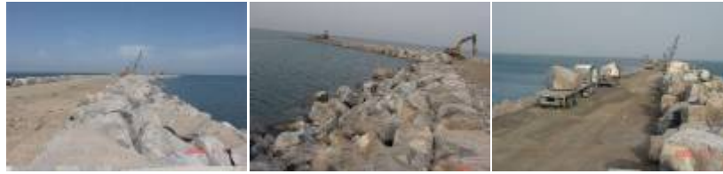
Al kateeb Marines Military Harbor Project

In the last 20 years as example of the contracting projects, Alwadei Group has been involved in the design and construction of seven harbors and marine structures all over the Republic of Yemen.