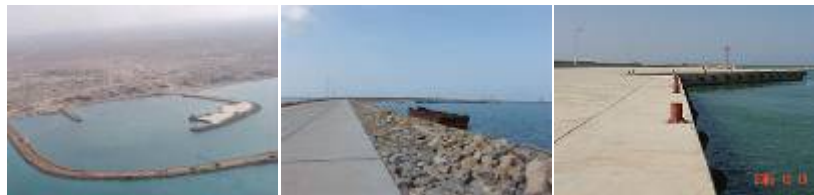
AL - khokhah Harbor Project

In these projects more than 10 Km Length of Breakwaters have been implemented with 6 million cubic meter of rocks of weight between 0.5 Kg to 20 tons. Alwadei Group is honored, qualified, and registered in the first class in the field of civil engineering and marine constructions in the Republic of Yemen.