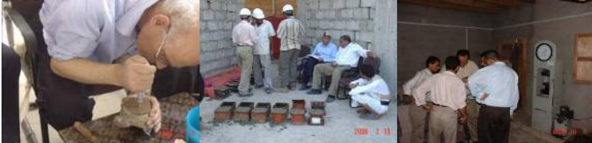
Quality Control in Every Step with Skilled Project Teams

With the extended experience and all needed qualifications in marine projects design and building, quarry work, available large-size of equipments, and expertise technical personnel, Alwadei Group can take contracts of the biggest projects in marine construction and results in a high quality and cost effective product.